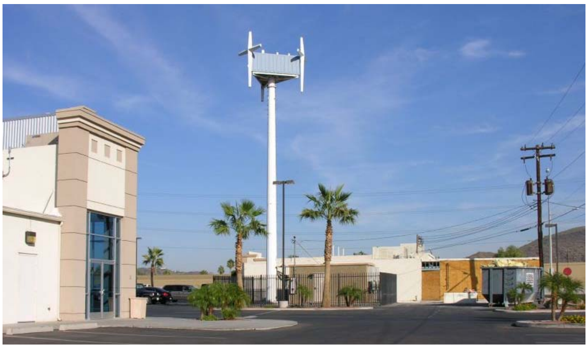
Figure 5: Semi-camouflaged Monopole wireless site in Phoenix, Arizona.