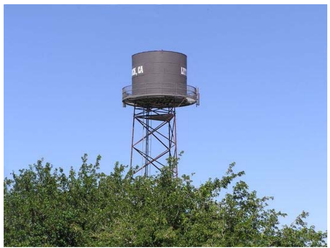
Figure 13: Faux water tank wireless site in Littlerock, California