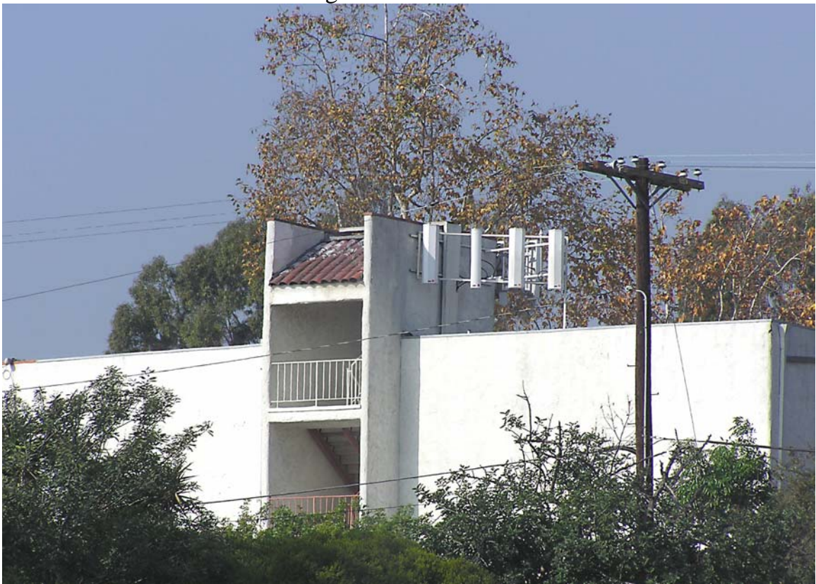
Figure 9: Exposed wireless site on roof in Los Angeles, California.