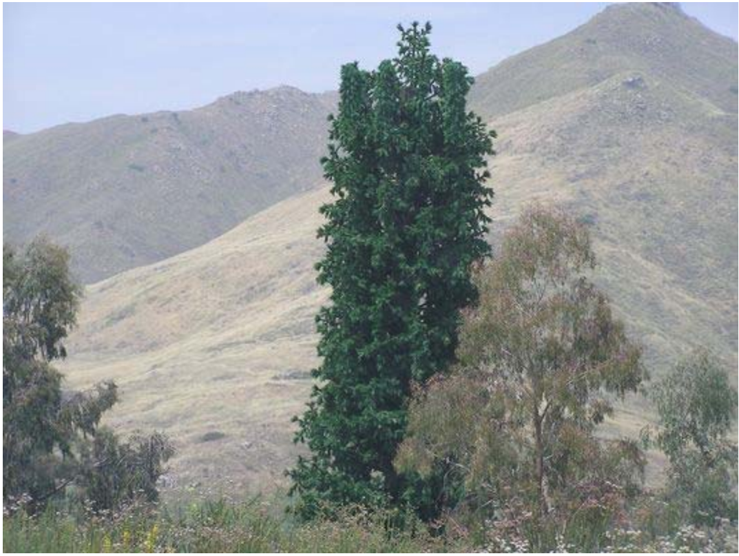
Figure 7: Superior Monopine wireless site in Lake Elsinore, California.