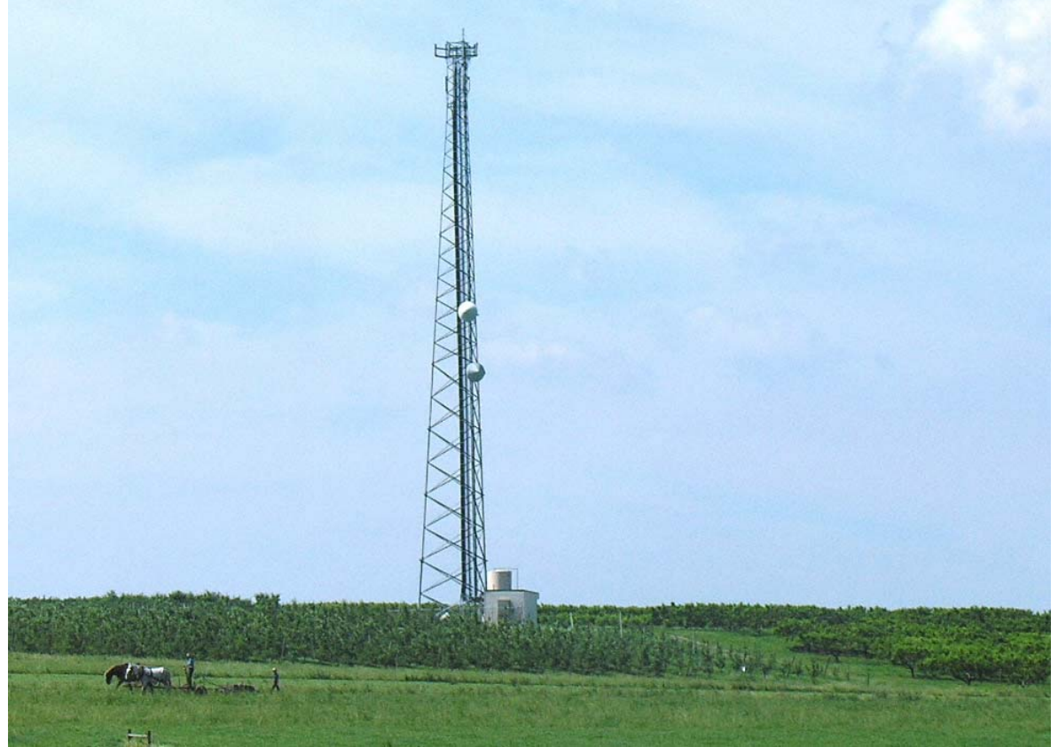
Figure 1: Self supporting wireless tower site in Bird-in-Hand, Pennsylvania.<sup>18</sup>

<Balance of page intentionally left blank>