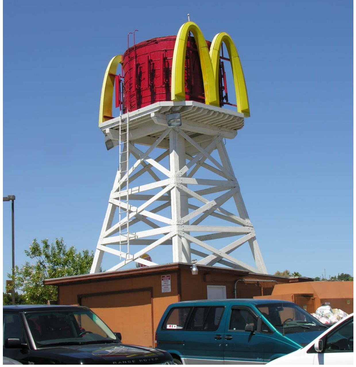
Figure 11: Faux water tank/advertising sign wireless site in Barstow, California