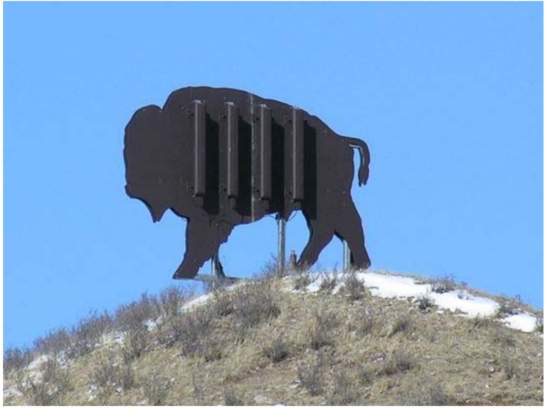
Figure 12: Faux bison wireless site on mountain peak near Carr, Colorado