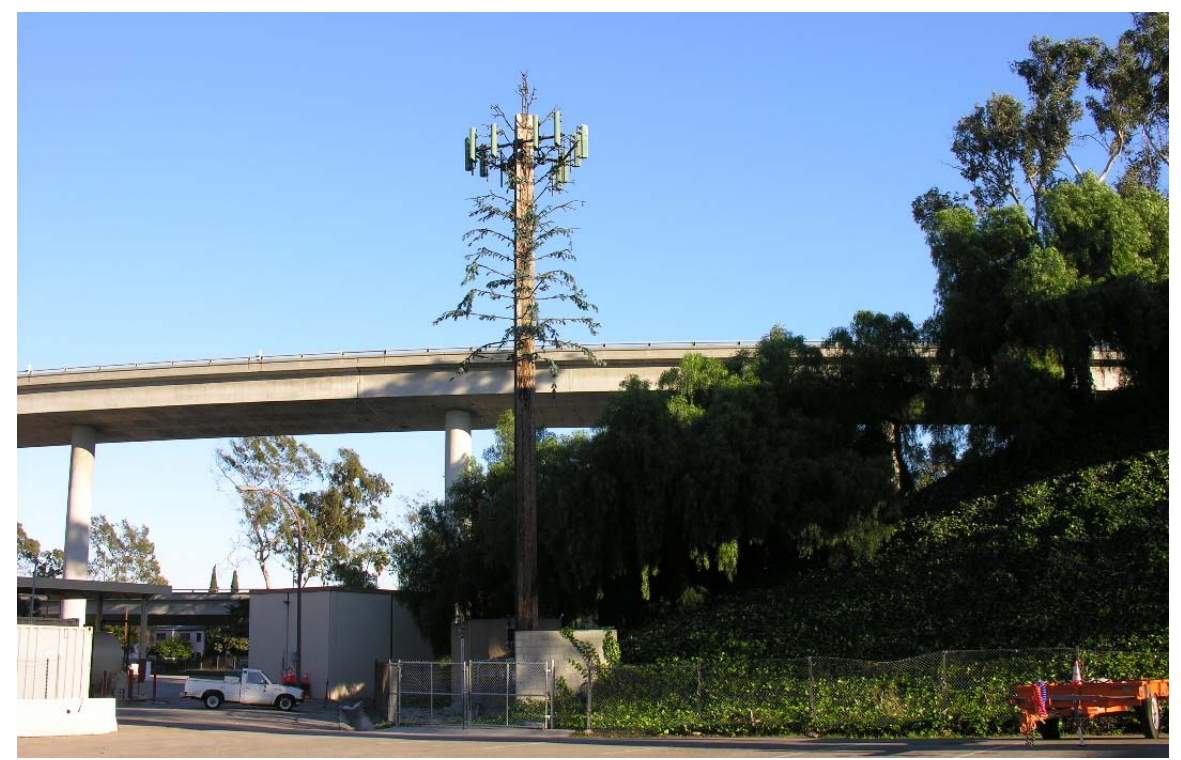
Figure 6: Inferior Monopine wireless site in Los Angeles, California.