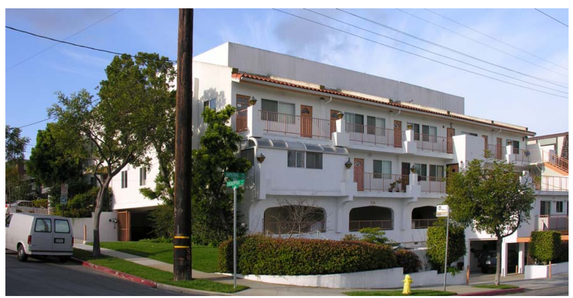
Figure 10: Wireless site hidden behind roof parapet in El Segundo, California.