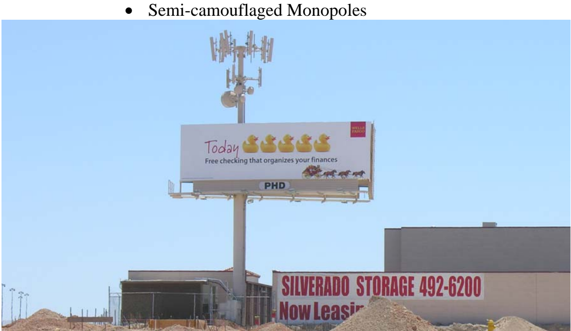
Figure 4: Semi-camouflaged Monopole/advertising billboard wireless site in Henderson, Arizona.